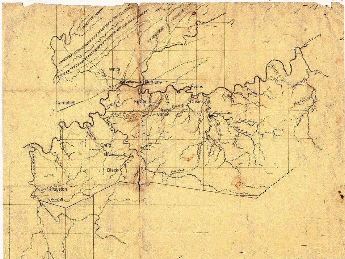
RHEA FAMILY PAPERS - BOX NO. 2. 14. MAPS - TENNESSEE - FRENCH BROAD & HOLSTON TENNESSEE STATE LIBRARY AND ARCHIVES, NASHVILLE TENNESSEE

The Tennessee 1796 Constitution gave residents south of French Broad certain second class citizen rights. Though they could not own property, they got promise of pre-emption rights on part of their property. By permitting them to hold office, Cocke, Sevier, and Blount counties