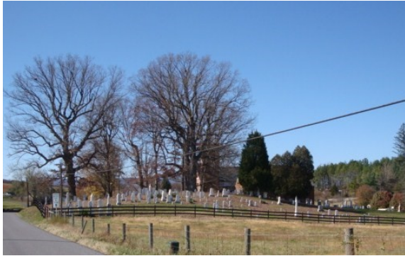
Hebron Cemetery, N 38.14250 W 79.15446 State Route 703, 5 miles west of Staunton